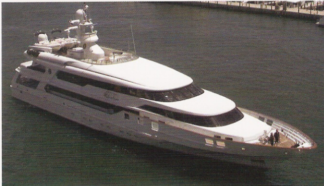
50m motoryacht Princesa Valentina , Vosper stabilizer retrofitted with a Naiad DATUM S@A™ system.

Effective roll damping of a vessel not making headway, such as when at anchor or adrift, has been a persistent motion control problem. As marinas become increasingly crowded and slips more difficult to obtain, owners and guests are more frequently aboard under anchored or moored conditions. Harbors, being busy and relatively shallow, often generate wave conditions that cause significant rolling, especially when the wave period nearly matches the yacht's natural period.